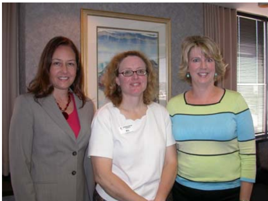
Photo: Junior League members serving on the 2007-2008 Leadership Springfield Board of Directors